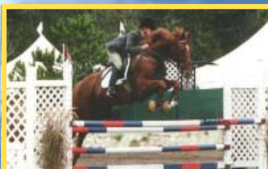
"A" circuit show horses provided

At Cavallino Farms, riders revel in our show grounds atmosphere and exclusive one on one private training. Located at the prestigious Collier Equestrian Center in Naples, Cavallino Farms offers personal hunter/jumper training at one of the finest facilities in Southwest Florida. This manicured property with a large covered ring and open riding arena, complete with show quality jumps, is exactly what the serious equestrian is looking for.