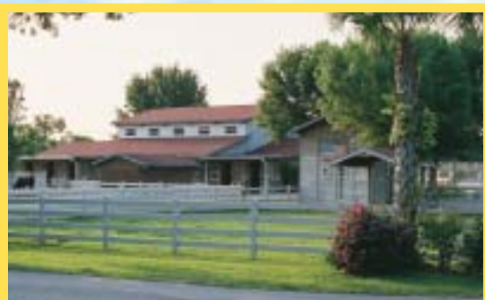
Boarding & private lessons

At Cavallino Farms, riders revel in our show grounds atmosphere and exclusive one on one private training. Located at the prestigious Collier Equestrian Center in Naples, Cavallino Farms offers personal hunter/jumper training at one of the finest facilities in Southwest Florida. This manicured property with a large covered ring and open riding arena, complete with show quality jumps, is exactly what the serious equestrian is looking for.