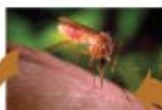
West Nile Virus

Mosquitoes become infected by feeding on infected birds and pass the virus to other birds, animals, and people.