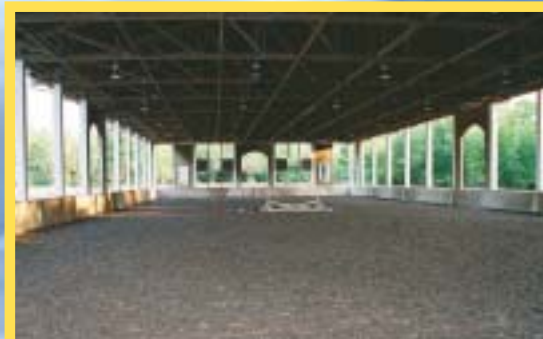
Beginner to advanced

For the equestrian without his or her own horse, we provide everything! Cavallino Farms not only offers training on our best hunter/jumpers but also allows our riders the use of our horses in many of the "A" rated shows we attend.