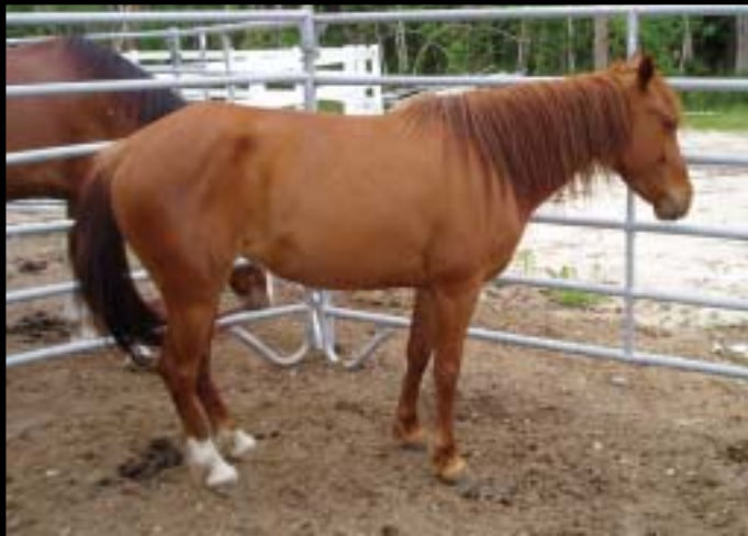
5 yrs old mare very sweet & smart, 12.2 hands, my daughter wanted a bigger horse. Asking $3,500.00 Naples, 239-591-1086 cell 239-289-3901