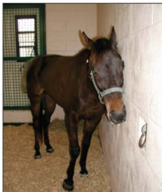
Figure 1 —Clinical signs of WNV include stumbling, incoordination, and weakness of limbs. However, horses may become infected without exhibiting any clinical signs.

Horses may become infected without showing any clinical signs. Fever is not a common sign.