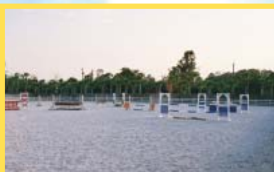
Hunter / Jumper training