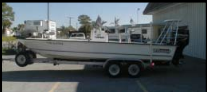
Cant get away from your other half to enjoy your horse? Here is a new toy for that non-horsey partner of yours! 2000 Triton Tunnel 22', '99 200hp Mercury Optimax, Jack plate, pole platform, VHF, Trolling motor, triple charger, Depth finder, GPS, dual live wells, aluminum trailer $18,000 239-229-4200

Why travel North when you can get good looks and good rides close to home? My horses are reasonably priced for the average person! Just to name a few - there is a 13 month old Appaloosa, a diamond in the rough palomino and Smokey who has been there done that(English & Western). Golden Gait Ranch now offers full care board w/ use of facility, $350/mo. Horse sales and lease options available.