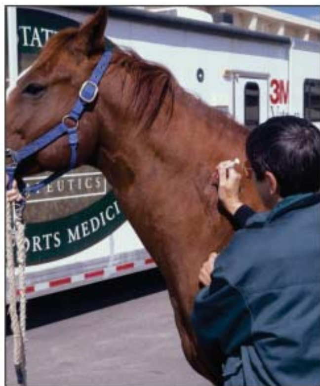
Figure 2 —Vaccinate your horses before mosquitoes are likely to bite and infect them.

You can decrease the chance of your animals' being exposed to the virus by limiting their exposure to mosquitoes. The best way to do this is to reduce mosquito breeding sites.