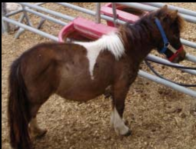
1.5 yrs old . 23" very pretty , mare $ 3,500.00 239-239-591-1086 or cell 239-289-3901