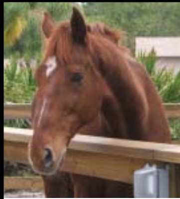
Juan is a family horse. He is a beautiful 16.1H 12 year old TB gelding in awesome condition. He loves attention and loves kids. He can ride all day and loves trail riding. He is 100% sound and UTD on everything. He is very experienced in the arena and does flying lead changes automatically. Excels in Dressage. He has been to many shows and always places at the top. He has been used for English and Western lessons and has even been roped off of. He is really easy to ride and enjoys his work. Am selling this horse because I have outgrown him. I would love to see him go to a caring family. Price negotiable to approved home. $4250 Phone: 239-877-2795