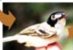
West Nile Virus

During periods of blood feeding there is continual transmission between mosquitoes and their bird hosts. Once a bird is infected, it can transmit the disease to mosquitoes for 4–5 days. Mosquitoes may feed on the bird's blood, far from the initial location, and become infected with the virus, furthering the spread of the disease.