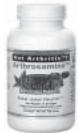
120 count, a $39.99 value