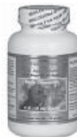
Beefy Chewables 60 count a $24.95 value

Arthrosamine Total Joint Health for humans