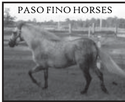
PASO FINO HORSES

TOP BLOOD LINES HORSES FOR SALE FOUR PASO STUDS, INCLUDING A PINTO